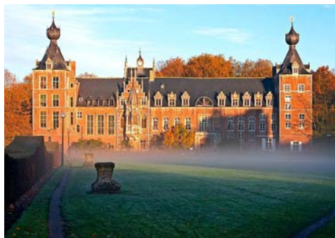
Leuven: Muntstraat and Castle Arenberg