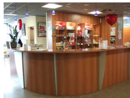
Bloedtransfusiecentrum Vlaams-Brabant-Limburg in Leuven