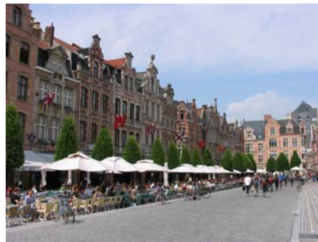
Leuven Town Hall and Oude Markt (Belgien)