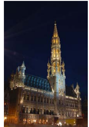
Brussels: Atomium and Grand Place